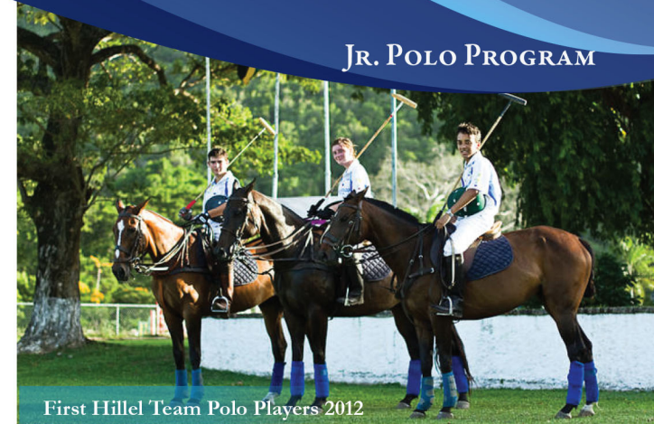
First Hillel Team Polo Players 2012