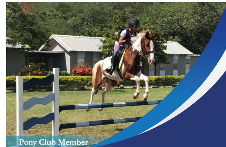
Pony Club Member