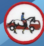
Road Rider Badge