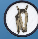
Points of the Horse Badge